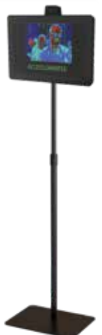
APS-1 pole stand

The TAURI Temperature-Check Tablets are designed to detect temperature anomalies. It's important to understand there are many factors, including environmental and physiological that can impact a person's surface temperature reading. Skin surface temperature vs actual core body temperature may differ either way. The TAURI Temperature-Check Tablets must be operated in accordance with the manufacturer's user guide. TAURI Temperature-Check Tablets are not intended nor designed to diagnose or detect medical conditions including, but not limited to, viruses or other illnesses. The TAURI temperature-check tablets should only be used to detect variations in surface temperature. In the event that an elevated skin temperature is detected, the subject should be advised to check temperature with an approved medical thermometer and the finding confirmed. Absence of an elevated skin temperature does not preclude a fever.